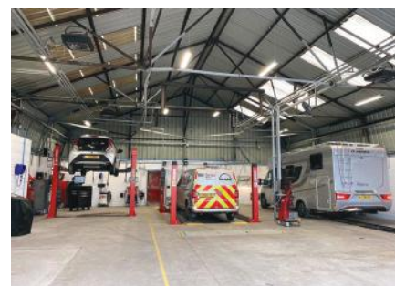
Servicing and MOT Testing at Swansea, with LED lighting and biomass boiler heating

Improving technology: we know that old and inefficient IT is demotivating and so we have continued our commitment to keep computer equipment up to date with Digitrol providing ongoing support and ensuring that no computer is in the business for more than three years.