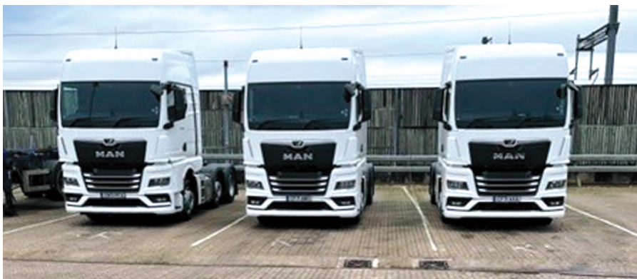
We prepared and delivered a TopUsed vehicle (below right) for Stone Supplies (Wales) Ltd, while our longstanding customer, Interhaul, took delivery of this stunning TGX tractor unit (below left):

We were delighted that Freight Systems Express Wales (FSEW) were able to take delivery of these three TGX tractor units: